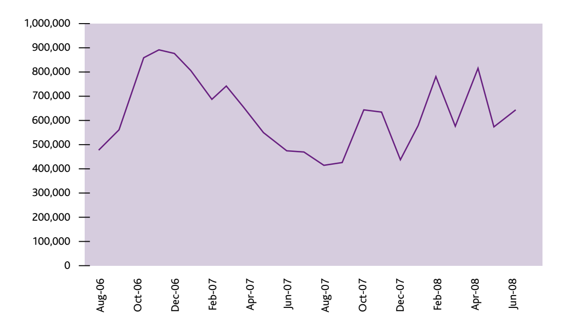
Figure 1 Web site use August 2006 to July 2008 (page hits)