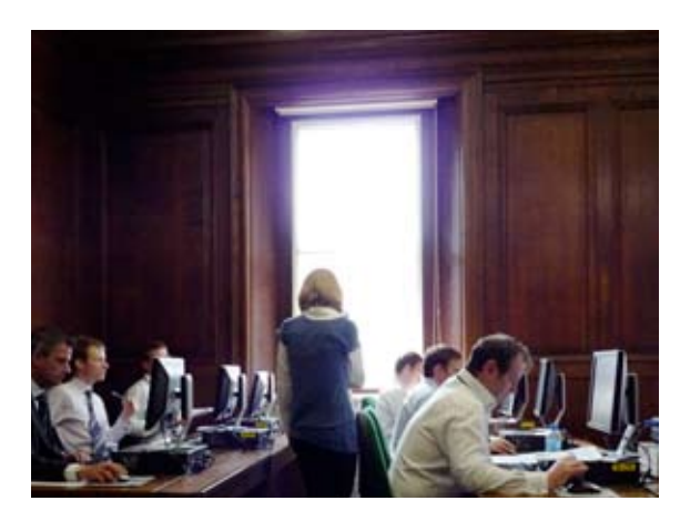
Delivering a training course at the House of Commons library

The service has also enhanced its macrodata portfolio with the negotiation of access to the IMF World Economic Outlook database. This global time series database contains country-level projections for the next five years on topics such as national accounts, inflation, unemployment rates, balance of payments, trade and commodity prices.